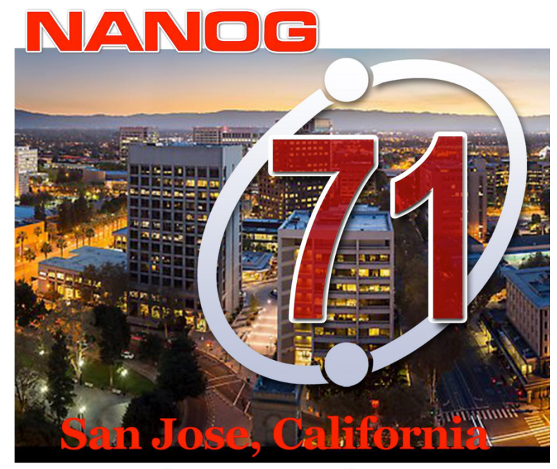
October 2 to October 4, 2017

NANOG 71 Hackathon takes place October 1, 2017 and the conference runs October 2-4, 2017. Both will offer a great opportunity to network with colleagues, freshen-up skills, learn advanced networking techniques, and discover new network applications. NANOG 71 host sponsor is Equinix.