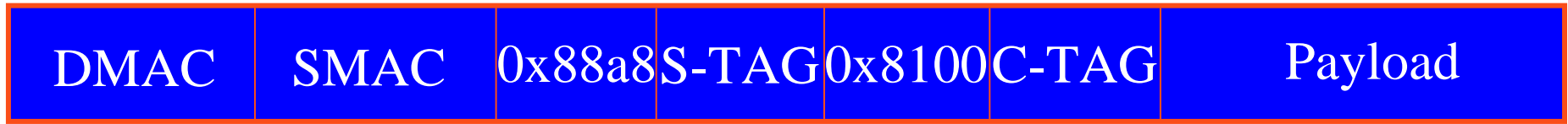
Tagged frame format